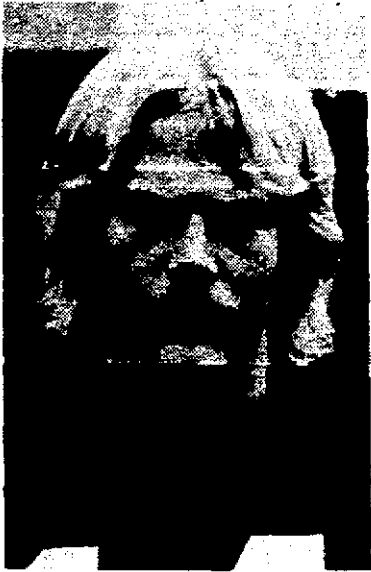
Duane Snyder Nitro Quarterback